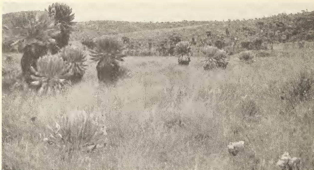
Fig. 2 Carex runssorensis bog ( Carex bog type 2, cf. Table 2, plot 23) with Dendrosenecio johnstonii ssp. elgonensis , Lobelia elgonensis and scattered specimens of Helichrysum amblyphyllum . The slopes in the background are covered by the Dendrosenecio elgonensis -community. (Foto: E. Beck, March 15th, 1983).